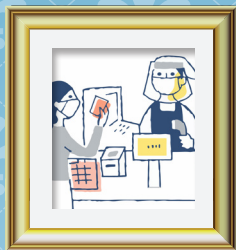
Callum Park Age: 7, Oldmeldrum