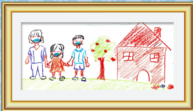
Paul Black Age: 10, Bridge of Don